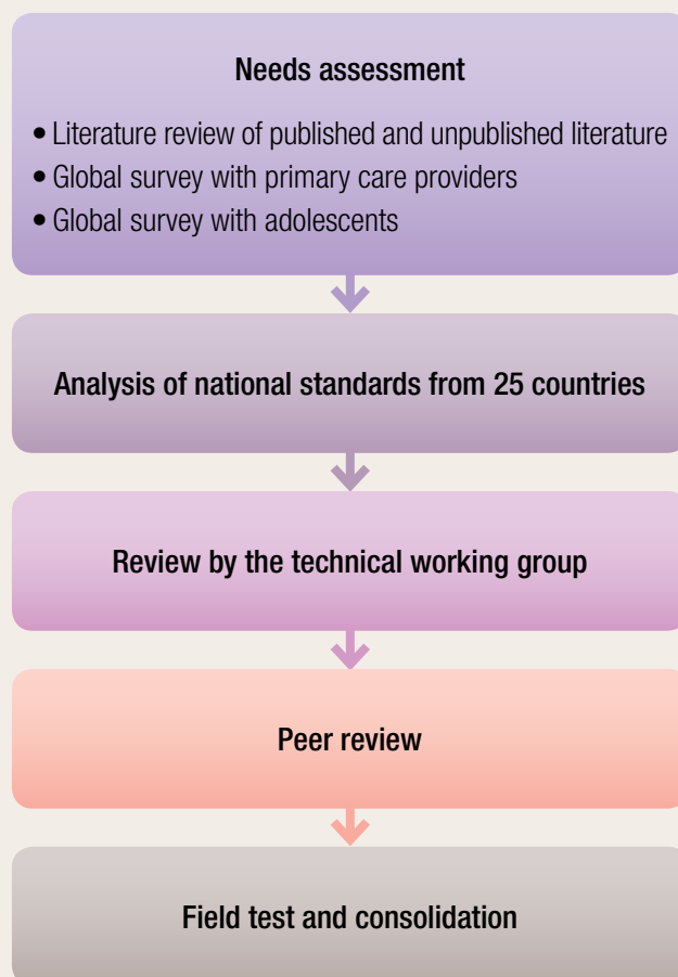
Fig. 1. The process for development of the global standards for quality health-care services for adolescents

WHO developed the global standards based on the needs assessment, which was informed by the literature review and online surveys, in conjunction with the analysis of 26 national standards from 25 countries: Bangladesh, Bhutan, Burkina Faso, Congo, Ethiopia, Ghana, India, Indonesia, Kyrgyzstan, Lesotho, Malawi, Mongolia, Myanmar, Nicaragua, Philippines, Republic of Moldova, South Africa, Sri Lanka, Tajikistan, Thailand, Ukraine, United Kingdom (England, Scotland), United Republic of Tanzania, Viet Nam, and Zambia. The analysis of national standards identified the most common standards 1 and their criteria, 2 which were then reviewed against the findings of the literature review and global surveys. Actions from